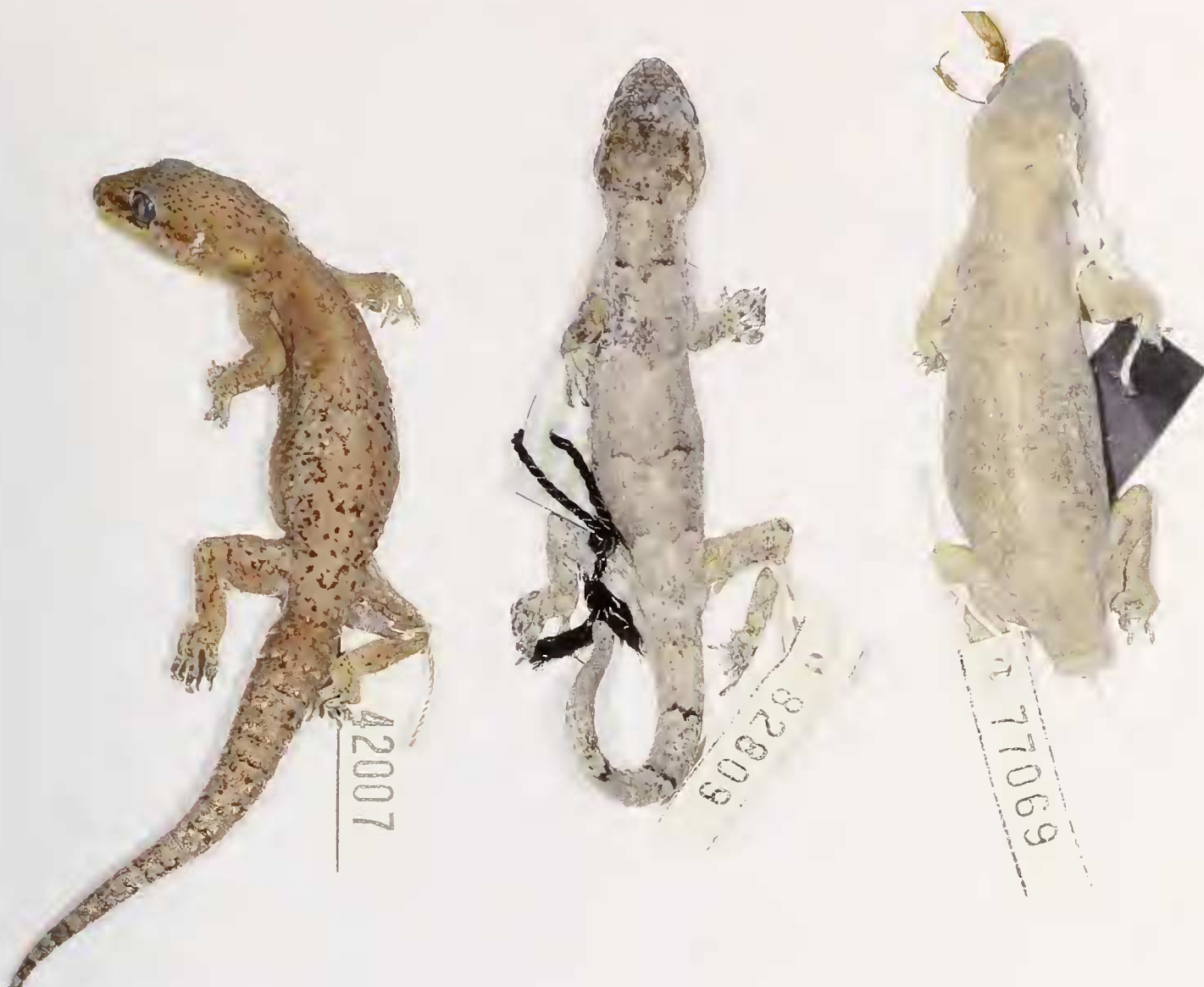
Fig. 12. Hemidactylus angulatus (s.str.) from Godomey near Cotonou (left), H. mabouia from Cotonou (center) and H. aff. mabouia, also from Cotonou (right).